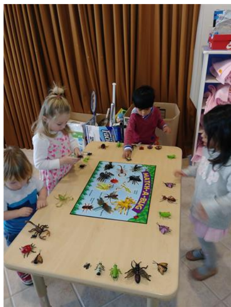
Children are using toy insects to learn how to match.