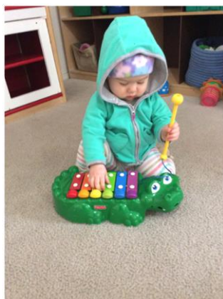
Making music and using the hearing sense. (Laguna site).