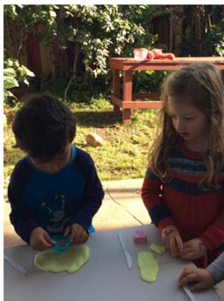
During sensory play: they play with slime, dough, water, paint, natural ingredients (flour, corn meal and more) in order to feel the texture and model figures.