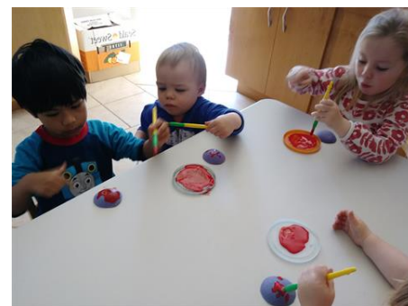
Painting ladybugs (Skyline location).

The Wildcare Nature Van will be visiting Monte Tavor. Children from the Skyline location are welcome to join us with their families on Thursday, May 24, 2018 from 9:00am to 10:00am. Children from the Laguna location are welcome to join us with their families on Friday, May 25, 2018 from 9:00am to 10:00am.