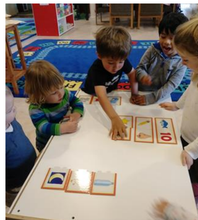
Children continue to practice different activities that can help them recognize rhymes, found in stories, songs, riddles, poems and puzzles.