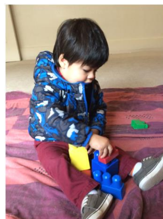
Stacking Legos (Laguna site).