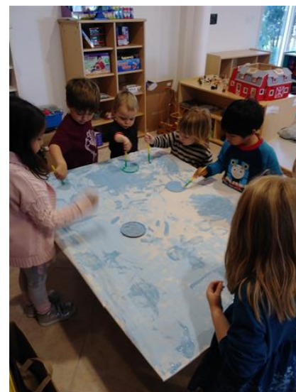
Starting to work on their Animal Habitat Project Scenery (Skyline location).