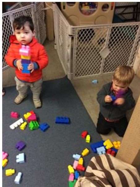
Using Legos as a way to learn how to stack, connect, and use their imagination.