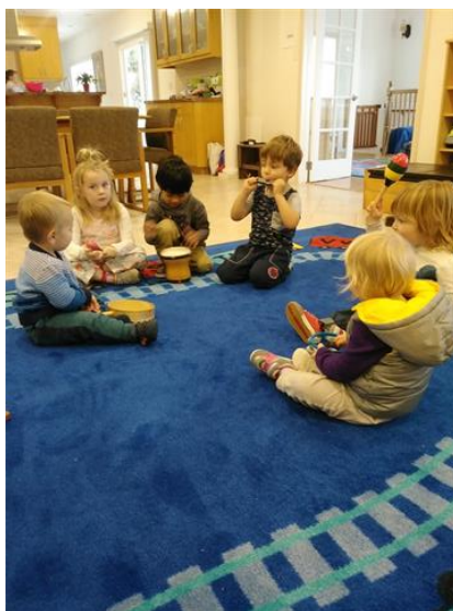
Learning about different instruments and their sounds in order to make up a song.