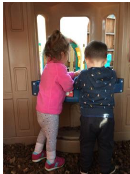
Pretending to cook together during pretend play.