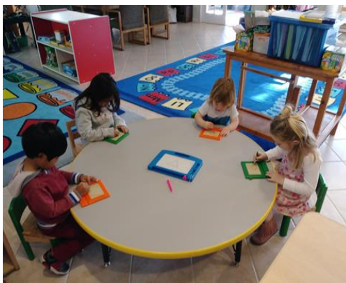
Learning how to write the alphabet letters, numbers and draw shapes.