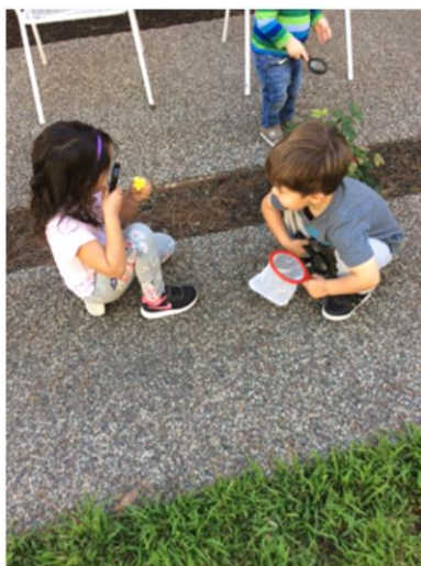
Observing an insect on a flower, at Skyline location.

The Oakland Zoo Mobile will be visiting Monte Tavor. Children and their families from both locations (Skyline and Laguna) are welcome to join us on Friday, April 6, 2018, from 9:00 am to 9:30 am. This event will only be presented at the Laguna location. We hope to see you all there!!