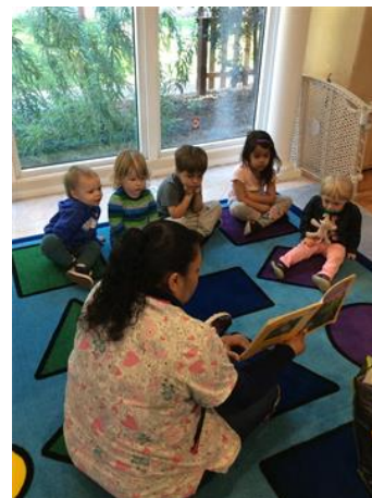
Story time (Skyline site)