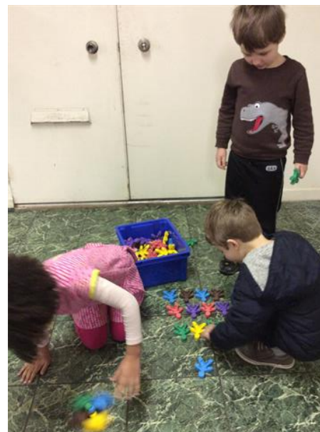
Finding different ways to play with toys. In this picture, they are using toys (that are human shapes) to create different patterns.