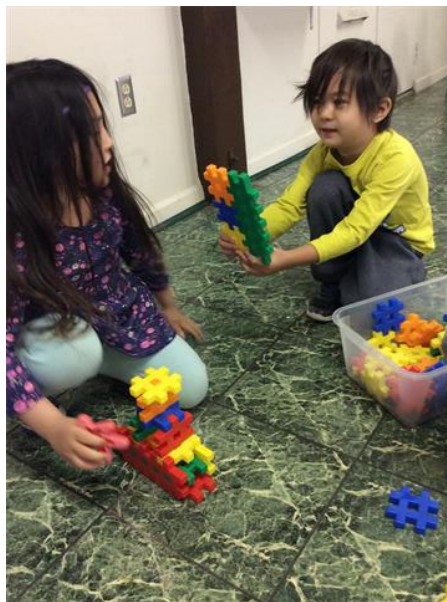
Children continue to connect different manipulatives in order to build and use their inventiveness.