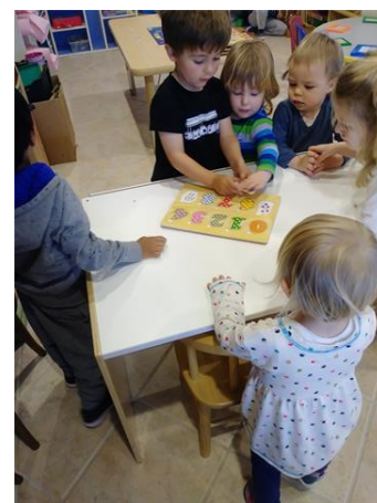
Children continue to practice different activities that can help them count and recognize numbers, found in books, songs, riddles, poems, puzzles, games and more indoor and outdoor activities.