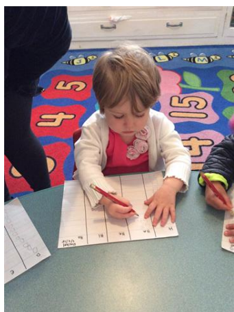
Learning how to write. (Laguna site)