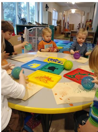
Using different objects and materials to create art. In this picture, children are using spiky balls and paint to create an amazing colorful painting.