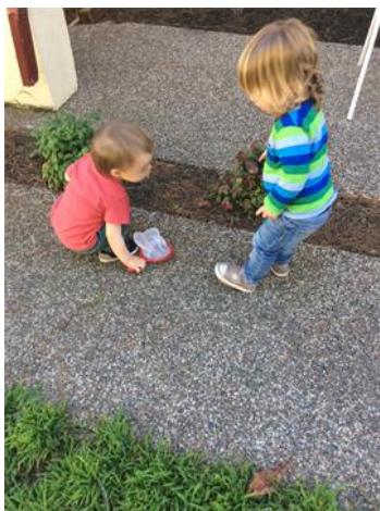
Looking for insects at the Skyline location.

The time of the Animal Habitat Project has arrived. During the month of April, each class will pick one out of the five major habitats (forest, desert, water, grassland and tundra). After they pick one of the five major habitats, they are going to get more specific and focus on only one. For example: If they pick water, they can focus on either a river, pond, lake, ocean, or a marsh.