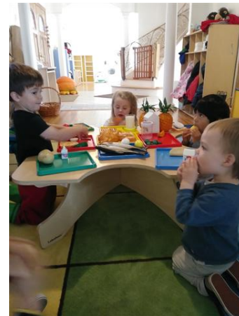
Children are participating in dramatic play, such as restaurant, bakery, house, store and doctor.