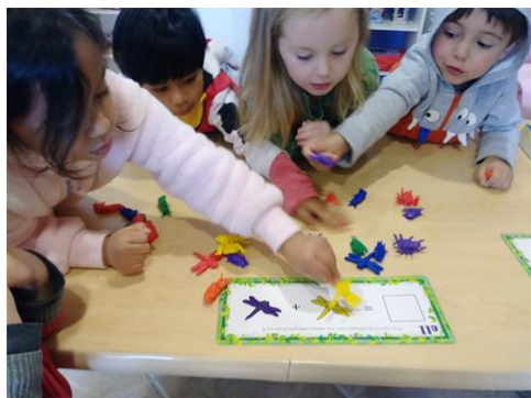
Using colorful different insects to do different activities such as matching, pattern, puzzles, and math.