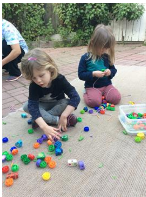
Using bottle caps with a string to learn how to design and do patterns.