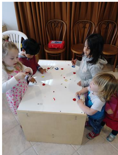
Using magnets to discover what is magnetic and what is not.