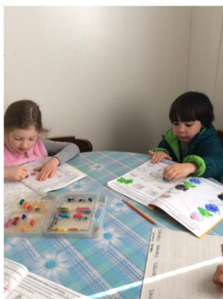
Working on their activity workbooks. (Laguna site)

As children continue to grow and learn new things, their brain continues to develop and improve by practicing many skills. Each age group, is working on specific activities that are age appropriate. Graduates and preschoolers continue to work on their activity workbooks, where they learn to write alphabet letters, short words, numbers, colors, tracing, patterns and much more. They also practice listening skills by following directions, in order to prepare them for Kindergarten. Toddlers continue to stack Legos, practice how to write and draw by using writing tools, modeling clay and playdough. Infants are still developing their five senses by using sensory tactile toys, cloth and board books, musical instruments, listening to songs, and being outdoors when all possible. In addition, all the age groups are listening to stories, learning songs, riddles and poems. Practicing those skills can be beneficial for children as they learn and improve their Spanish language, when speaking and writing words, letters, short and long phrases.