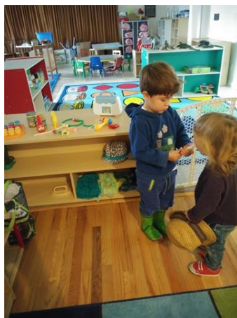
Dramatic Play: Playing doctor. (Skyline site)